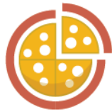
SOLO 9" INCH (4 SLICES)