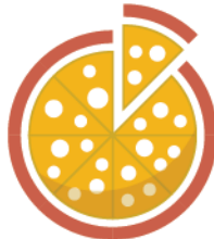
GRANDE 14" INCH (8 SLICES)